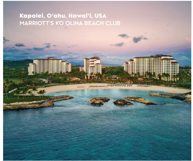
Kapolei, O'ahu, Hawai'i, USA MARRIOTT'S KO OLINA BEACH CLUB

Marriott Vacation Club International and their respective affiliates and subsidiaries make no warranty, express or implied, as to the condition, capacity, performance, or any other aspect of the activities, events, or service providers listed herein. No inquiry has been made into the activities or events, or the qualifications or the quality of services offered by the providers. Do not consider this an endorsement of or recommendation for any of the activities, events, or providers. The examples provided herein are subject to change.