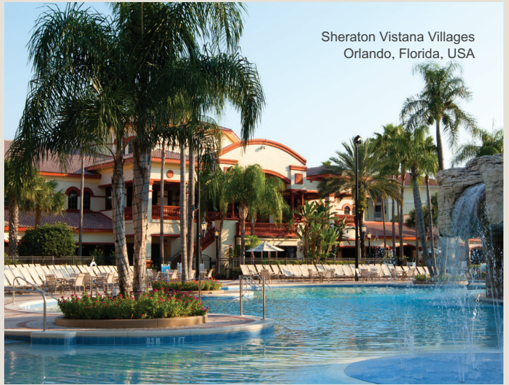
Sheraton Vistana Villages Orlando, Florida, USA