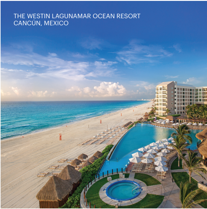
THE WESTIN LAGUNAMAR OCEAN RESORT CANCÚN, MEXICO