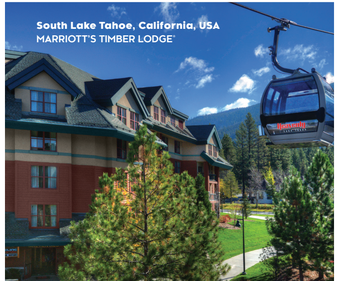
South Lake Tahoe, California, USA MARRIOTT'S TIMBER LODGE®