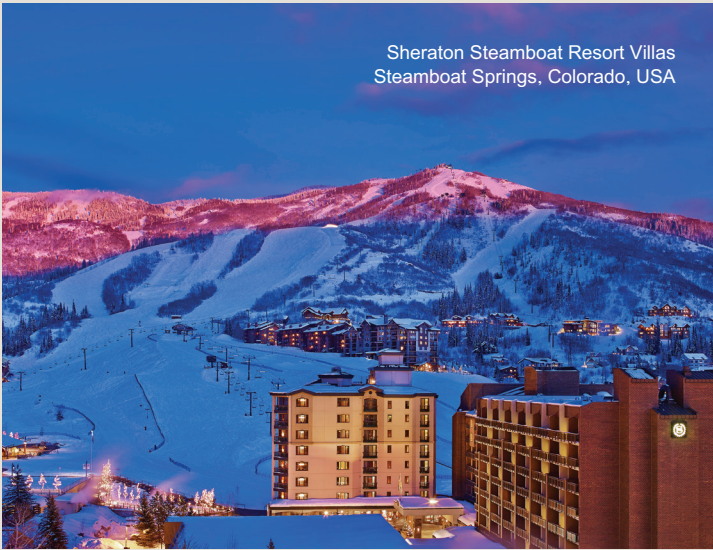
Sheraton Steamboat Resort Villas Steamboat Springs, Colorado, USA