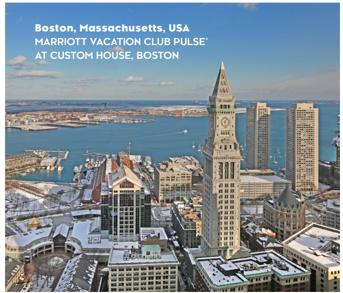
Boston, Massachusetts, USA MARRIOTT VACATION CLUB PULSE® AT CUSTOM HOUSE, BOSTON